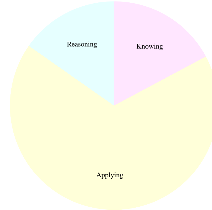
IMP Year 2